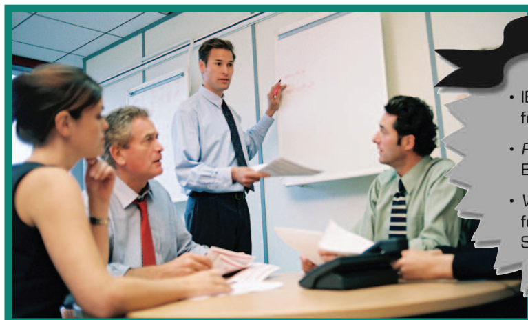
Lighthouse has more than 70 employees with diverse IT expertise.